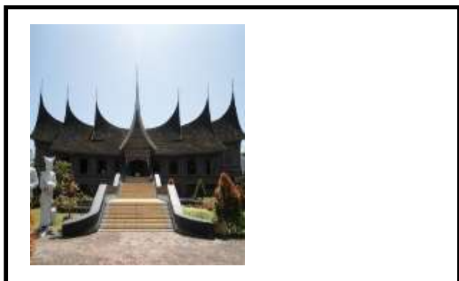
Aditya Warman Museum