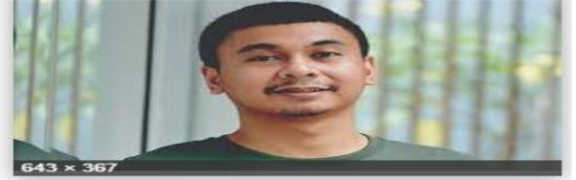
643 x 367 Raditya Dika: Close to The Heart | Colours colours-indonesia.com