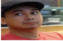
a dika (@radityadika) |... com