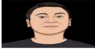
Raditya Dika - YouTube youtube.com