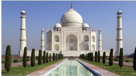
Picture 4.3