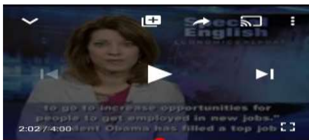
Obama Enters 2012 Race on Good News About Jobs

Click the link https://youtu.be/FwLiRfvRCJM