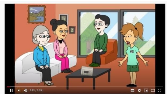
English for Carers: Future Plans