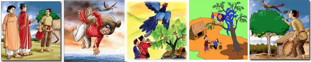
I II III IV V