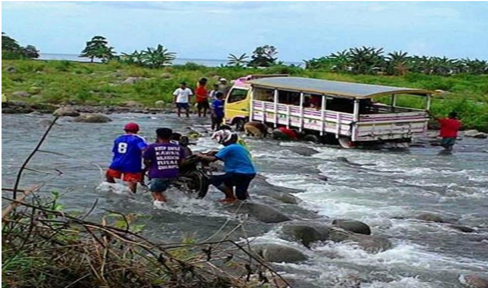
Wae Musur river, Elar, East Manggarai – NTT on November 10, 2020